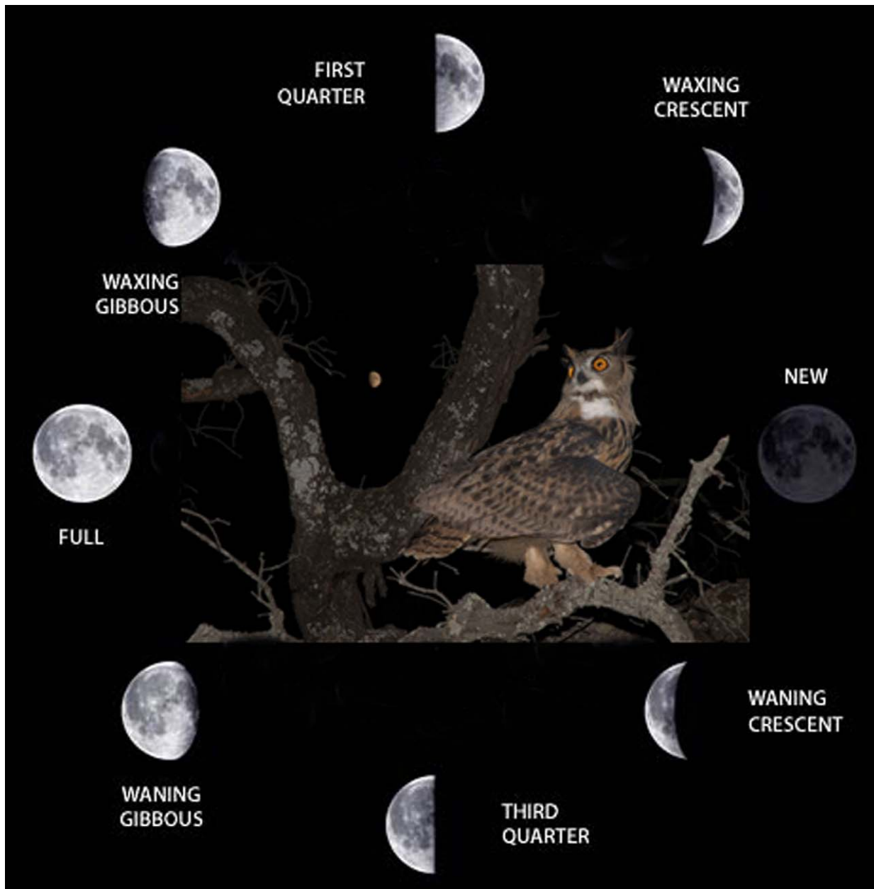
Figure 1. The five lunar phases that have been considered in the analyses (see the text for more details): new moon, waxing/waning crescent, first/third quarter, waxing/waning gibbous and full moon. The waxing/waning phases and first/third quarter moons (often called a “half moon”) have been grouped together because of their equivalent illumination ( http://aa.usno.navy.mil/faq/docs/moon_phases ). doi:10.1371/journal.pone.0008696.g001

conspecifics [16]. Light levels of moonlight are similar to the light levels at dawn and dusk [18], when eagle owls perform the most vocalizations [16]. This could suggest that nocturnal birds simply take advantage of any source of natural light to increase the effectiveness of their visual communication.